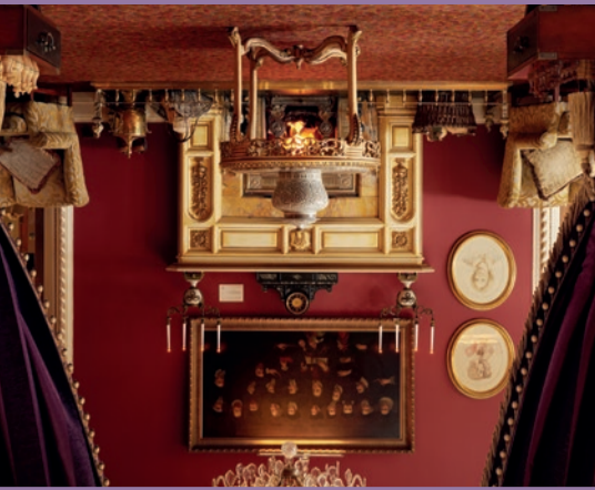
The impressive fireplace at the Culloden.

The hotel was bought by Sir William Hastings in 1967. Since then it has been expanded and has become internationally renowned for its luxury. In 1996 the Culloden Estate and Spa became the first hotel in Northern Ireland to be granted five star-status. The hotel now boasts 105 deluxe bedroom suites, 11 luxurious self-catering apartments, six private banqueting suites and a fabulous Health Club and Spa.