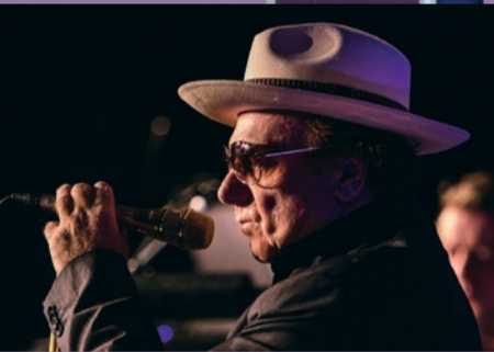
Legendary musician Van Morrison